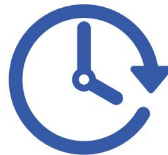
Time period 3 weeks