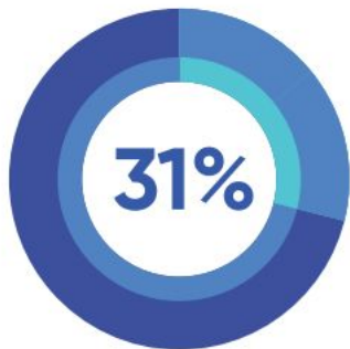
SEO Traffic increase of 31%

After implementing the initial phase of the SEO plan, we were able to see immediate results after just 3 weeks. By focusing on the biggest indexing issues we were able to see big early wins with both traffic and class bookings.